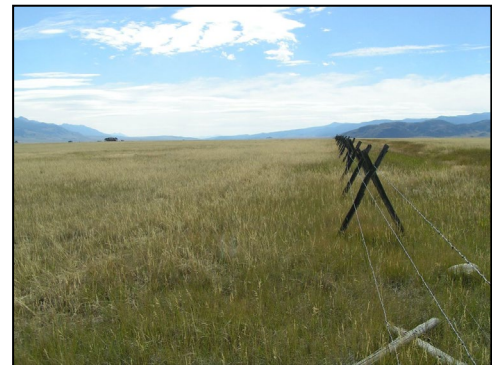
Looking south along western boundary

Note: All information contained herein is gathered from a variety of sources deemed reliable, however, is not guaranteed or verified by the seller, ERA Landmark Arrow, or any of its associates. We urge independent verification of each and every item submitted to the satisfaction of a prospective purchaser.