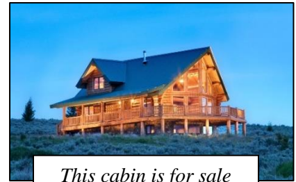
This cabin is for sale and would make a great vacation rental!

➤ REAL ESTATE TIPS → Vacation Rentals in Montana . There is a strong demand for vacation rentals in Montana. So, buyers often expect to offset the cost of a Montana property with rental income. It can be practical and profitable – or not, depending on how attractive the property is and how well it is maintained, marketed and managed. One other important factor, that has been generally overlooked, is licensing . Who knew?? But, if you are an owner, get a license. If you are a renter, ask to see the license. Don't rent a home without it! What you don't know can hurt you. The details are listed below: