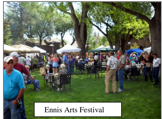
Ennis Arts Festival

The 17 th Annual Ennis Arts Festival was held on Saturday August 11 th in the park. The weather was perfect, the vendors were plentiful and it was just fabulous. Many people were wishing it lasted for TWO days! No fires in the Madison Valley to report, but the Smoke from Idaho fires has filled the valley for weeks, hiding the mountains and filling the air with ash. These are the times we pray for Wind to blow away the smoke!