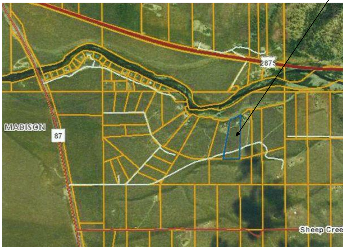
HOOK AND HORN SUBDIVISION PLAT